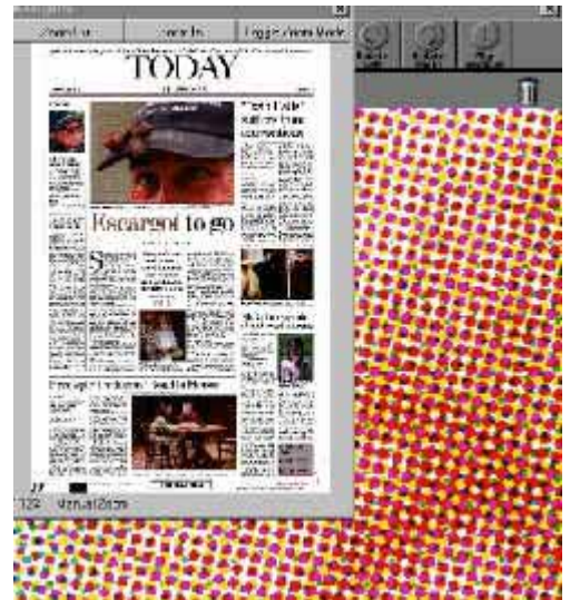
magnified view of dot structure

ProImage proof Server has proven its cost-effective use in editorial, pre-press and press environments where checking pages for placement (post-RIP) and content, as well as color matching, has reduced error, saved valuable time - and money.